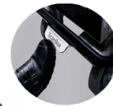
includes central brake